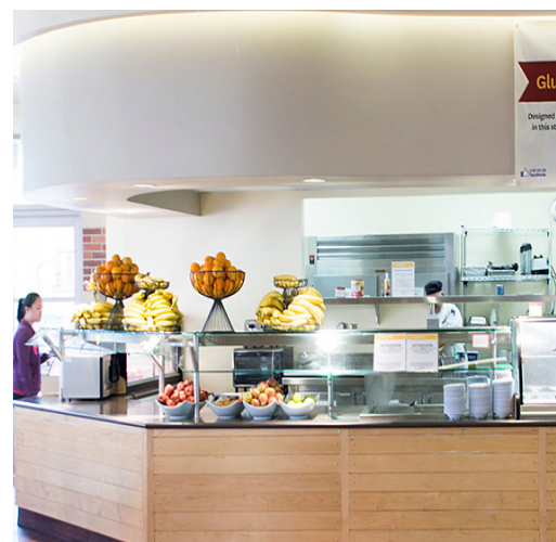
Parkside Restaurant & Grill

USC Hospitality offers an exclusive meal plan for International Academy students. The International 60 Meal Plan can be used in any of three all-you-can eat cafeterias inside the USC Campus.